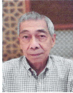
Our Resource Speaker